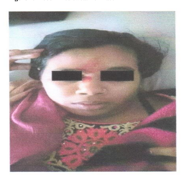
Figure 2:Blood mixed sweat from face