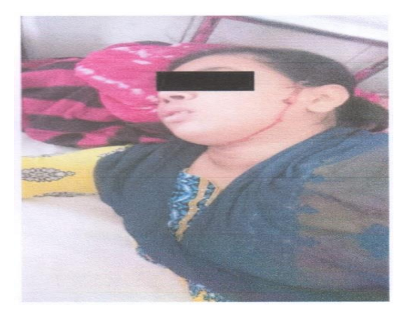
Figure 1: Blood mixed sweat from face

No history of any previous bleeding manifestation was available. No drug history to mention expect occasional NSAIDs for headache.